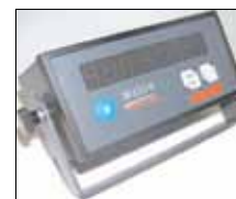
Desktop or Support Mounting Arm